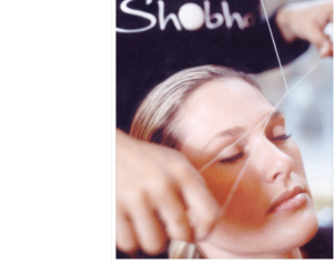
eyebrow threading services at Shobha

I've been getting my eyebrows threaded for years. Unfortunately the options of where to go are so limited here in D.C. You can catch me at Union Station or Pentagon City Mall at those open stands, sitting in a chair as everybody walks by and just stares.