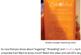
Shobha rosewater freshening cloths

So now that you know about "sugaring", "threading" and Shobha , try it all out! And say adios to that unwanted hair! Want to know more? Watch this video and visit DC's very own Shobha salon coming soon!