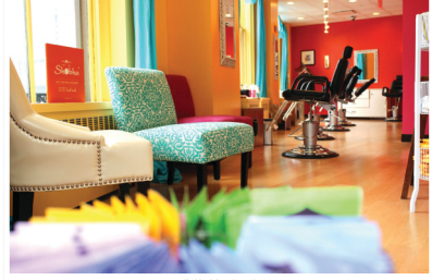
Shobha Salon pictured

We won't have to wait long for Shobha , a sanctuary for hairless happiness slated to open in the DuPont Circle area this Spring. Have you ever tried sugaring or threading before? Well soon you can. Already on the map in several locations in Manhattan, now D.C. finally gets it's chance to be a little less hairy and get super pampered.