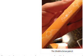
The Shobha brow pencil

Eyebrows can make or break you. Anybody who knows me, knows I'm obsessed with having a perfect brow. So I thread regularly — about once every 2 1/2 weeks and I use the Shobha *enhance earth* for brunettes brow pencil.