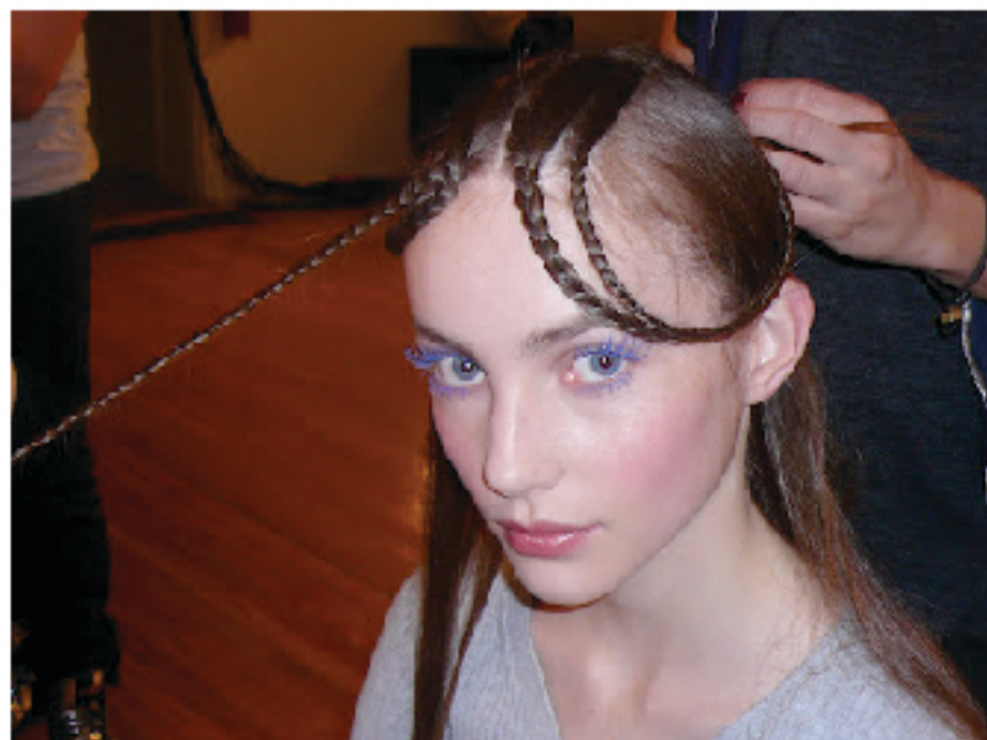
{violet lashes at an old chris benz show}