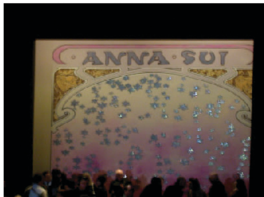
{the backboard of ana sui show, reminds me of my blog's background}