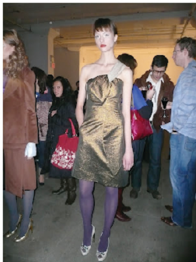
{i can't remember what show this was, but the clashing colors were so much fun}

it's new york fashion week again. nyfw and i are old friends. while i have a love/hate relationship with the crowded shows/tents and being the fattest and shortest person in most rooms for the entire week i realize how lucky i am to have my own small niche that allows me to participate in this nyc institution. i'm hoping i'll run into some of my favorite bloggers from around the country and i will get to enjoy drinks, meals, and quick words with women i admire.