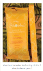
shobha rosewater freshening cloths & shobha brow pencil

i use either a mineral powder foundation or a liquid plus usually a concealer. i like arbonne concealer because it blends great and never breaks my skin out. it looks like they changed their packaging back to the old green style. i love bare minerals foundation , especially since they added the golden tones. neutrogena healthy skin liquid makeup the the best liquid i have found that you can score for cheap at target. this same line has a brightening eye perfecter that i may try when i run out of my smooch magic wand because it's a lot cheaper, so worth a try.