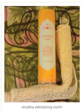
shobha exfoliating cloth!

shobha products are the shizzle (sorry about that word, but it goes with shobha. sorta.). i use several shobha products, but the rosewater freshening cloths & brow pencil happen to be my top 2 faves. there are so many good things about these products, you should check out the vids on both. now, full disclosure, i used to work for shobha, but that's not why i love & continue to use these products long after working for shobha. there's just nothing better to replace them with. oooo-that bow pencil! sharpener is in the lid, box is made of stone but feels more like paper & directions are printed inside the box! the rosewater cloths smell delish & can be used on ALL external body parts. of course, its all very safe & natural. if you're in nyc, you should def visit a shobha salon for brow shaping & body hair removal. now 4 locations! you won't be disappointed.