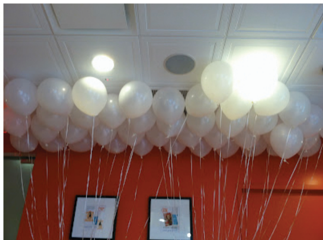
{white balloons against their signature orange walls at the celebration}

congrats to shobha , nyc's expert threading and hair removal salon, who recently relocated their columbus circle location . last week i joined them to celebrate their new address - 1790 broadway (directly across the street from their prior location). the building has a real old new york feel, the new salon is spacious, and the bathroom is directly across the hall.