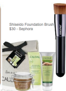
Shiseido Foundation Brush $30 - Sephora