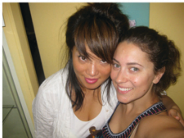
Style Pill Likes