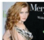
Rock the Look: Amy Adams Hair