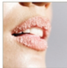
Sugaring Hair Removal Recipe