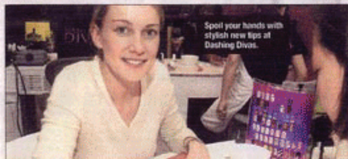
Spoil your hands with stylish new lips at Dashing Divas .