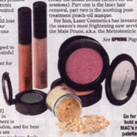
Go for the bold with MAC's new palette for spring.